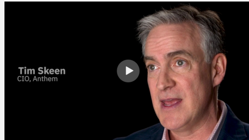
Anthem + IBM Services: Delivering better insights for better health (2:11)