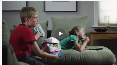
Frito-Lay + IBM: Empowering employees and delighting customers (2:43)